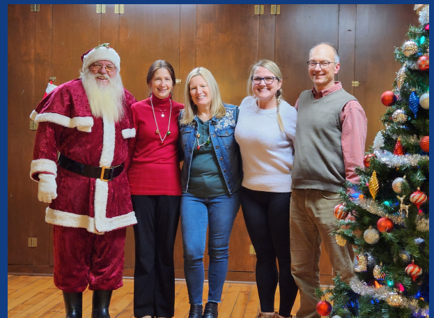
M&O 2022 Holiday Party